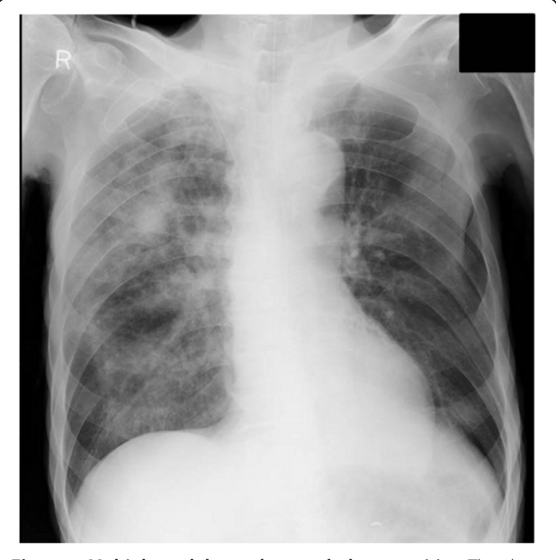
Figure 1 Multiple nodules and ground-glass opacities. The chest x-ray showed multiple nodules in the right upper lung field, and mixed ground-glass and airspace opacities in the entire right lung.

antifungal therapy the chest CT findings showed a remarkable improvement (Figure 3).