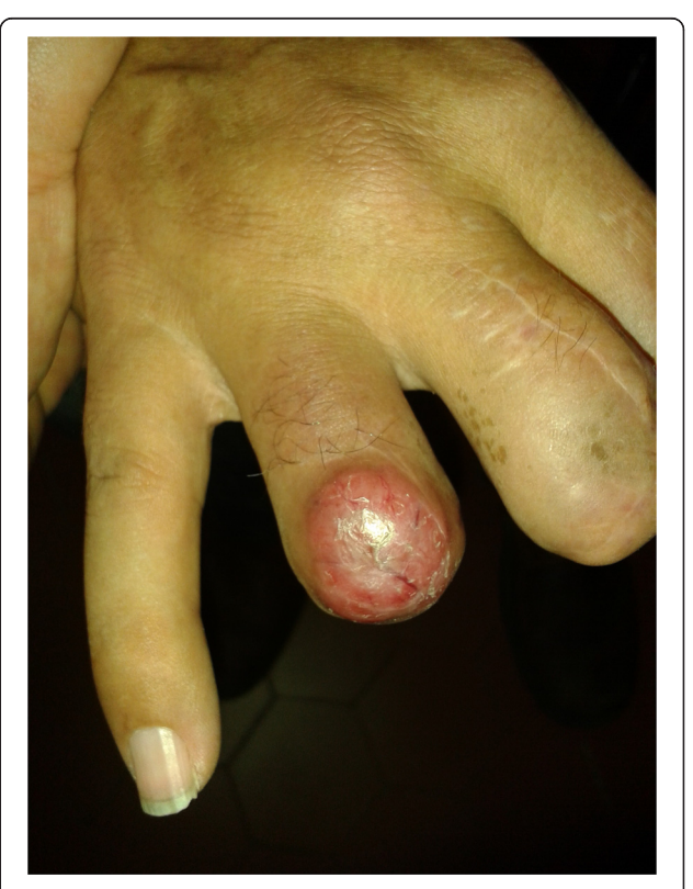
Fig. 3 The lesions tended to recur at proximal metacarpophalangeal joints of fingers amputated of distal parts

with an appropriate distance walked in relation to age and sex; a spirometry with \mathrm{DL}_{\mathrm{CO}} was performed, reported as normal in relation to age, sex and haemoglobin value. Mantoux skin test and IGRA test (Elispot-TB) were negative. PET/CT scan total body was performed showing amount of radiotracer in upper lobe of right lung (SUV max 4,01), mediastinal nodes (SUV max 6,70), skeleton in