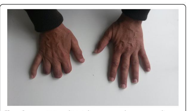
Fig. 1 Between 2008 and 2012 the patient underwent several surgical amputations of fingers: distal phalanges of second, third and fourth fingers of right hand

Ecg was normal, while echocardiography showed a little trans-tricuspid regurgitation and an assessed PAPs of 25 mmHg. Neurological examination was normal. Eye examination did not show significant pathologic findings. Blood gas analysis was normal for age, six minutes walking test was performed without pathological desaturation and