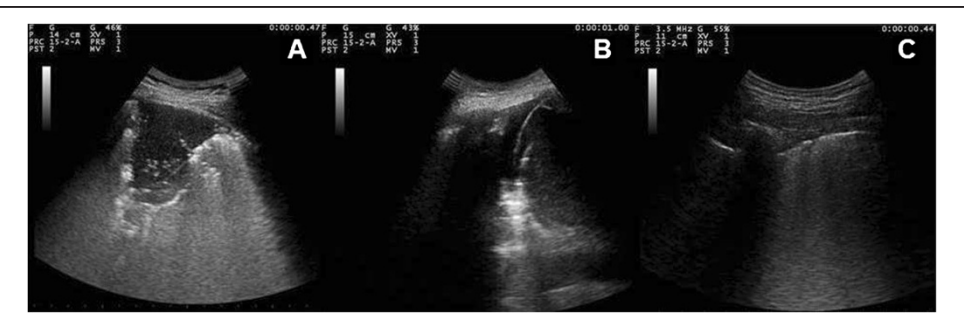
Figure 1 Chest ultrasonographic patterns: lung consolidation (A), pleural effusion (B) and sonographic interstitial syndrome (C).

As already reported in literature, the use of radiation for diagnostic imaging in pregnant women is associated